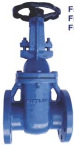
Fig. GV-501 (Class 125) Fig. GV-502 (Class 10K) Fig. GV-503 (PN10)