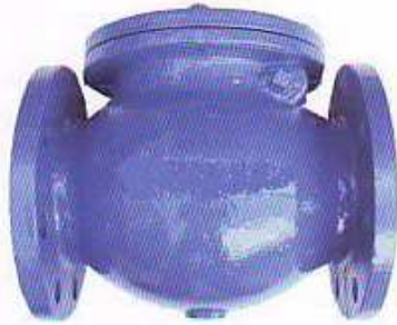
Fig. SCV-603 (PN10)